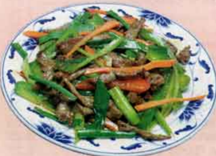
Hot & Spicy Shredded Beef