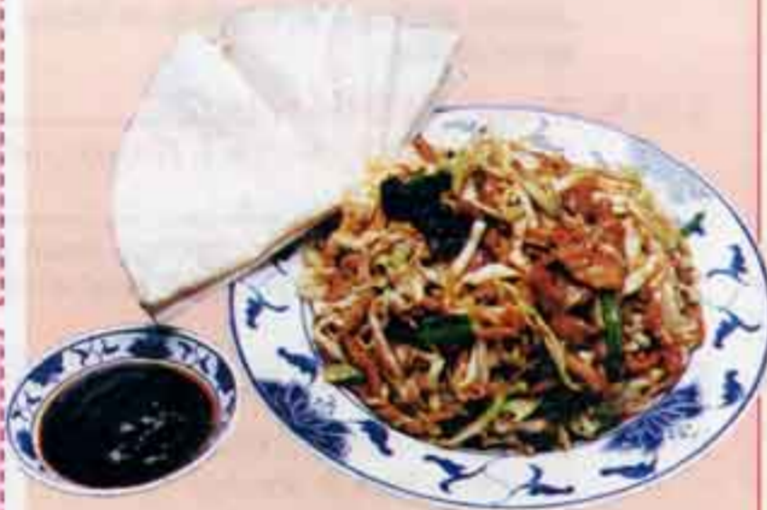
Moo Shu Pork