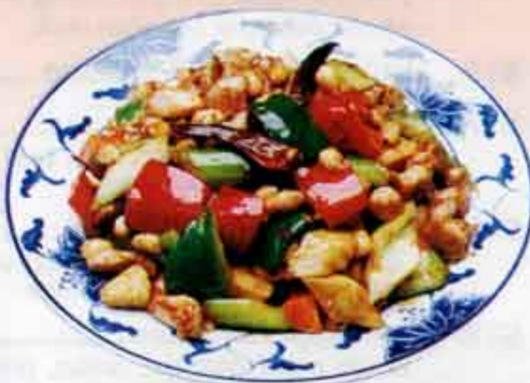
🔥 Kung Pao Chicken