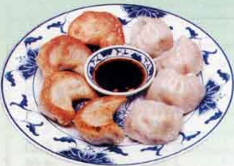
Fried or Steamed Dumpling