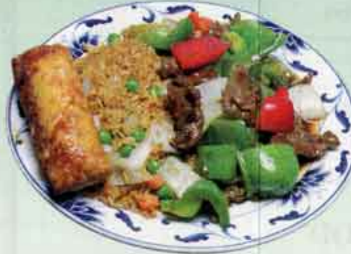
Pepper Steak Combo