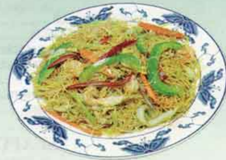
🔥 Singapore Mein Fun